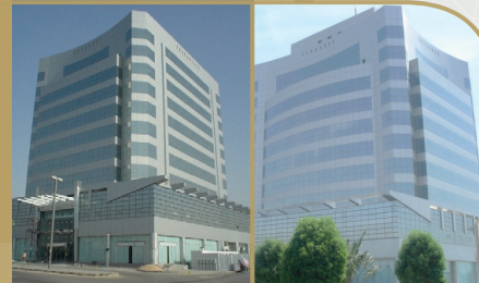
Al-Mulhim Al Dari Tower